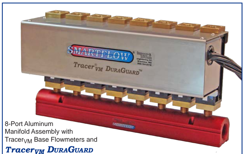
8-Port Aluminum Manifold Assembly with Tracer ® VM Base Flowmeters and Tracer ® VM DURA GUARD