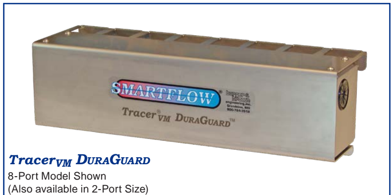
Tracer ® VM DURA GUARD 8-Port Model Shown (Also available in 2-Port Size)